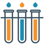
VERIFY API CONCENTRATION