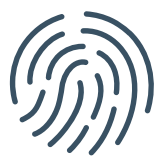
INVESTIGATE OUT OF SPECIFICATION