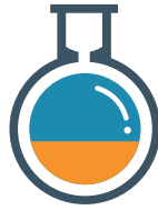
MEASURE PRODUCT STABILITY